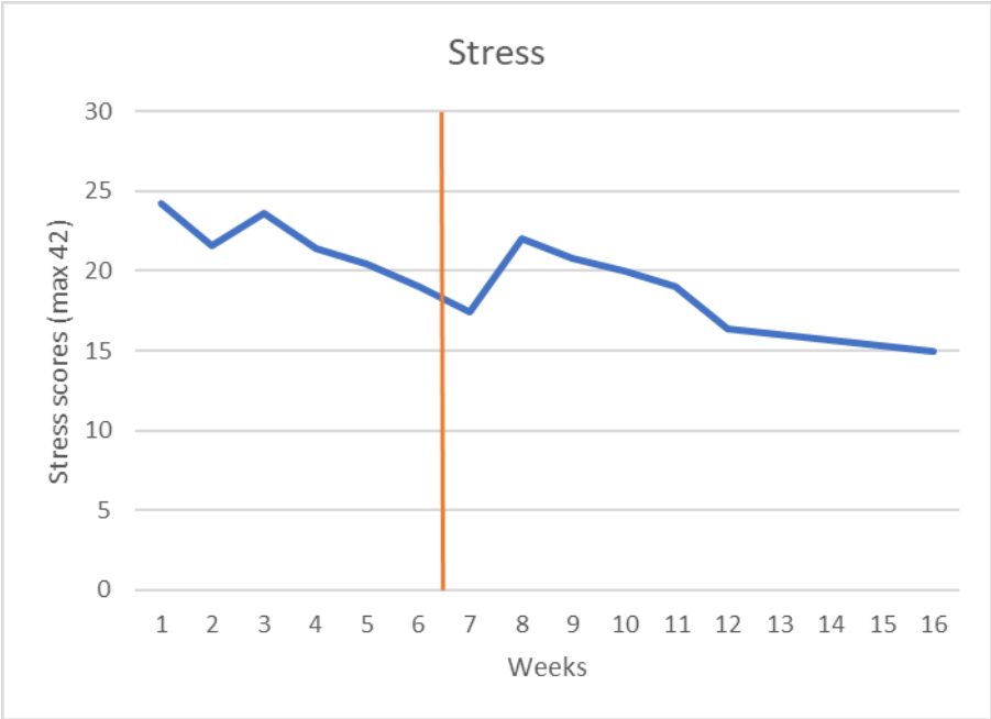
Figure 3: Results of DASS-42 for Stress

The average score of stress over the 6 weeks intervention period decreased from 24.2 to 16.4, a variation of 7.8, with a further decrease between week 12 and 16 dropping to 15.